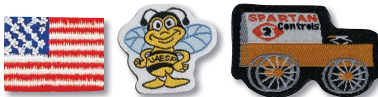
C: Embroidered Appliqués

2-3/4" x 2" one or two sided embroidery. Split ring attachment. These colorful keytags are economical yet durable. Up to 7 colors without a tape charge.