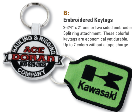
B: Embroidered Keytags

2-3/4" x 2" one or two sided embroidery. Split ring attachment. These colorful keytags are economical yet durable. Up to 7 colors without a tape charge.